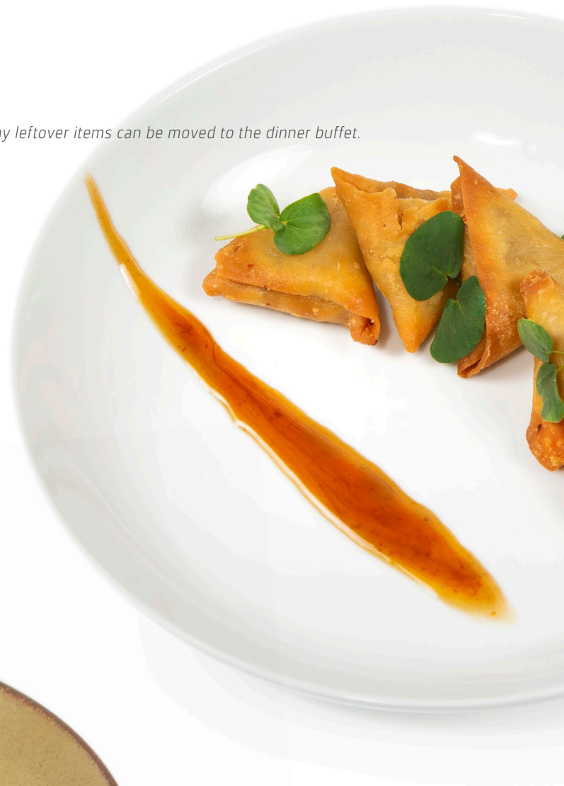
..... PANEER TIKKA | Vegetarian